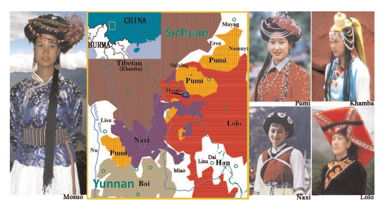
Figure 1. Geographic location of the Mosuo people and the ethnic groups around.

of all Sino-Tibetan populations. They originally lived in Northwest China, and some migrated to Southwest China about 2700 years ago, where they diversified into several branches. Among these branches, the Tangut-Qiang is most similar to the ancient Qiang (He 1999; You 1997).